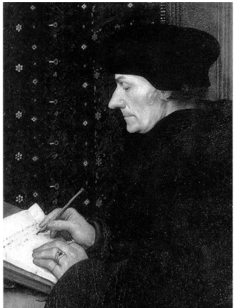
Erasmus: Painted by Hans Holbein, 1523

Erasmus' background and long and close association with English speaking persons was the reason the Erasmus Foundation chose his name. Key aims of the Foundation are to be a link with the Dutch culture for people with a Dutch background or connection who live in Victoria and to acquaint others with that culture.