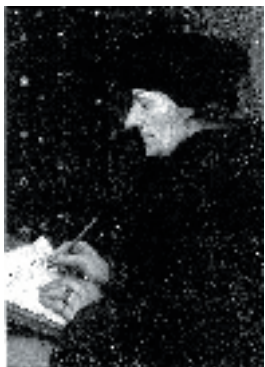
Erasmus: Painted by Hans Holbein, 1523

Erasmus' long and close association with English speaking persons was the reason the Erasmus Foundation Inc chose his name as a symbol of the cultural links between people of an Australian and Dutch background. Key objectives of the Foundation are to promote these links, as well as understanding and friendship between the people concerned.