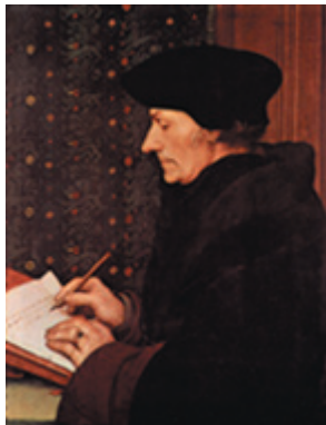
Erasmus: Painted by Hans Holbein, 1523

Erasmus' background and long and close association with English speaking persons was the reason the Erasmus Foundation chose his name. Key aims of the Foundation are to be a link with the Dutch culture for people with a Dutch background or connection who live in Victoria and to acquaint others with that culture.